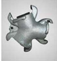
THREE WAY CLAW COUPLING