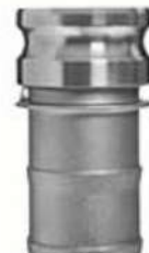
CAM AND GROOVE COUPLING TYPE E