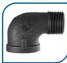
ELBOW 90° MALE / FEMALE