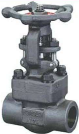
FORGED STEEL GLOBE VALVE MATERIALS - A106 /A182 SIZE : ½" TO 2" SOCKET WELDED END SCREWED END