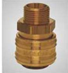
COUPLING WITH MALE THREAD