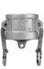
CAM AND GROOVE COUPLING TYPE DC