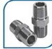
HEXAGON NIPPLE NPT 3000/6000 LBS Body: SS/ Carbon Steel Size : 1/8" to 4"