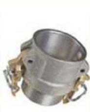
CAM AND GROOVE COUPLING TYPE B