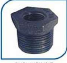
BUSHING M & F