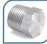
HEXAGON PLUG NPT 3000/6000 LBS Body: SS / Carbon Steel Size: 1/8" to 4"