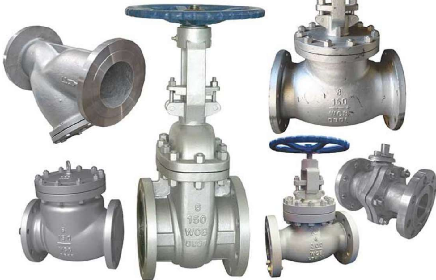
GATE VALVE - SIZE 1/2" TO 24", GLOBE VALVE - SIZE 1/2" TO 12", CHECK VALVE - SIZE 1/2" TO 12", Y STRAINER VALVE - SIZE 1/2" TO 8" CLASS FROM 150LBS UP TO 900 LBS AND FROM PN 10 UP TO PN 16