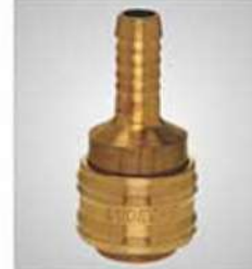
COUPLING WITH HOSE CLIP