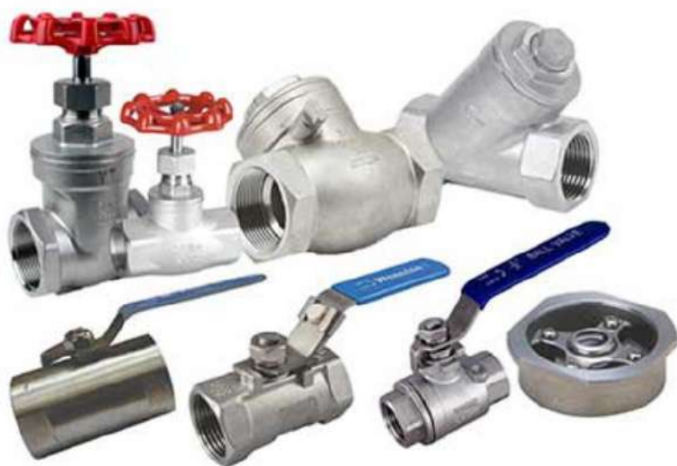
SS BALL VALVE, SS GATE VALVE, SS GLOBE VALVE, SS SWING CHECK VALVE, SS Y-STRAINER, THREAD END