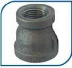
SOCKET CON. REDUCING