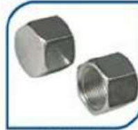
CAP NPT/SW 3000/6000 LBS Body: SS / Carbon Steel Size: 1/8" to 4"