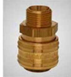
COUPLING WITH FEMALE THREAD