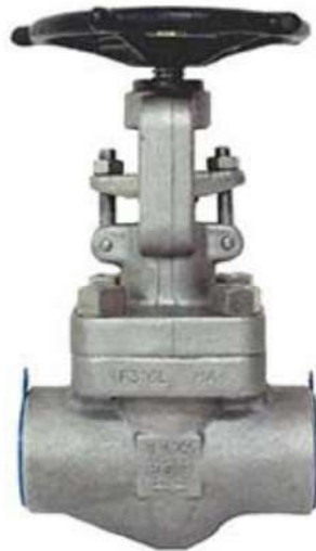
FORGED STEEL GATE VALVE CLASS 800 MATERIALS - A106 /A182 SIZE : ½" TO 2" SOCKET WELDED END SCREWED END