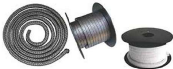
GLAND & TEFLON PACKING