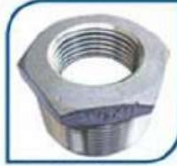
HEXAGON BUSHING NPT 3000/6000 LBS Body: SS / Carbon Steel Size : 1/8" to 4"