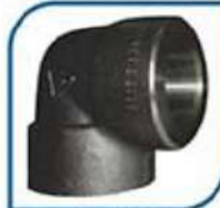
ELBOW 90° NPT/SW 2000/3000/6000 LBS BODY: SS / Carbon Steel Size : 1/8" to 4"