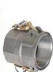
CAM AND GROOVE COUPLING TYPE D