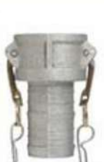
CAM AND GROOVE COUPLING TYPE C