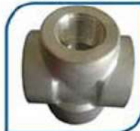
CROSS NPT/ SW 2000/3000/6000 LBS Body: SS/ Carbon Steel Size 1/8" to 4"