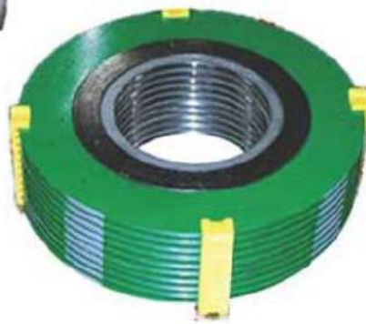
SPIRAL WOUND GASKET