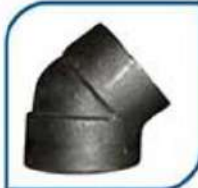
ELBOW 45° NPT/SW 2000/3000/6000 LBS BODY: SS/CARBON STEEL Size : 1/8" to 4"