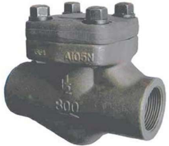
FORGED STEEL SWING CHECK VALVES CLASS MATERIALS - A106 /A182 SIZE : ½" TO 2" SOCKET WELDED END SCREWED END

CAST STEEL, STAINLESS STEEL FLANGE IN DIMENSION CLASS -#150, #300, #600, #900, #1500 PN-16, 25, 40, JIS - 5K, 10K, 16K