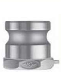
CAM AND GROOVE COUPLING TYPE A