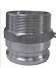
CAM AND GROOVE COUPLING TYPE F