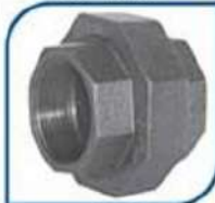
UNION NPT / SW 2000 / 3000/ 6000 LBS Body: SS / Carbon Steel Size : 1/8" to 4"