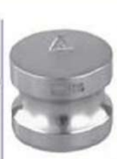
CAM AND GROOVE COUPLING TYPE DP