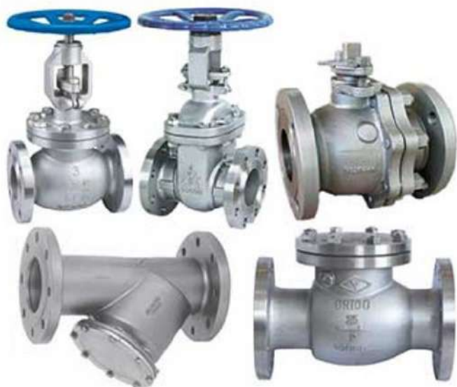
SS BALL VALVE, SS GATE VALVE, SS GLOBE VALVE, SS SWING CHECK VALVE, SS Y-STRAINER ANSI 150/300 FLANGED END