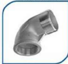
90° STREET ELBOWS