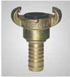
STANDARD CLAW COUPLING