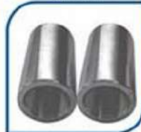
Full Coupling NPT/SW 3000/6000 LBS Body: SS / Carbon Steel Size : 1/8" to 4"